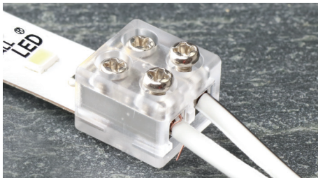
Live End Strip to Cable