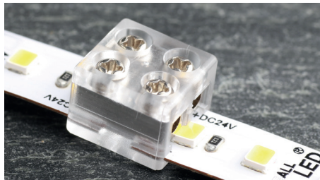
LED Strip Coupler Strip to Strip